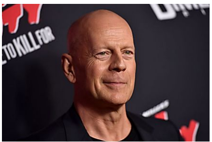
TV's Youngest Award-Winning Celebrities