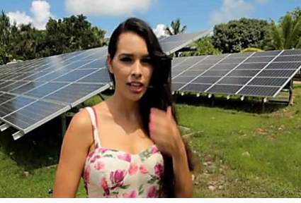
Thinking About Installing Solar Panels? Read This First