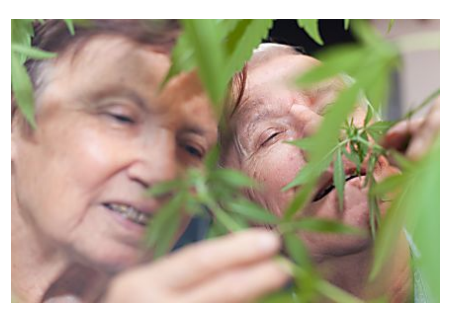
Become a "Mary Jane Millionaire" W/Penny Stocks (only $50)