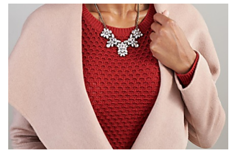
Let a Stitch Fix Personal Stylist Curate Your Winter Wardrobe