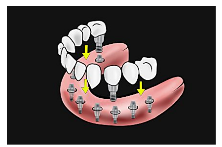
Here's What New Dental Implants Should Cost You - View Pricing & Dentist...